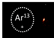
Sympathetically cooled highly-charged ions. Left: \text{Ar}^{13+} in a cloud of laser-cooled \text{Be}^+ ions. Right: Two-ion crystal of a \text{Be}^+ and an \text{Ar}^{13+} ion.