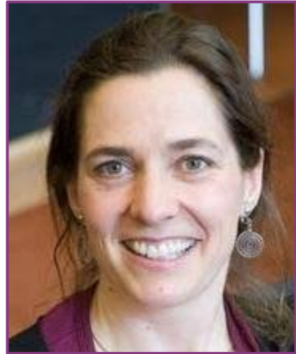
Susanne Yelin Senior Research Fellow Harvard University

Recently, such cooperative radiation emerged as a promising method for manipulating light and matter in systems ranging from unordered gases to ordered atomic arrays to two-dimensional semiconductor materials. For instance, cooperative effects can lead to entire manifolds of protected subradiant states whose decay rates approach zero with increasing system size, and to the realization of atomically thin mirrors with exotic properties. Alternatively, controlling the response of the atomic medium by combining spontaneous emission with strong, long-range could be used to control entangled many-body states of atoms. I will discuss several theoretical ideas, ongoing experiments to implement them, as well as potential applications of such effects, including realization of topological optical systems, quantum nonlinear optics, molecule cooling, and quantum information processing.